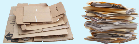
MIXED PAPER AND CARDBOARD

*For specialty items such as food containers like tubs, clamshells and other plastics, please contact your hauler.