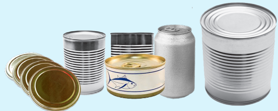
METAL FOOD AND BEVERAGE CANS