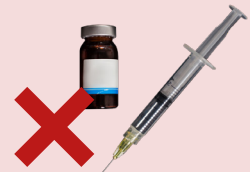
NEEDLES AND MEDICAL WASTE