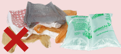
PLASTIC BAGS, FILM AND PILLOW PACKAGING