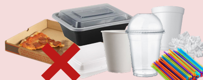
FOAM AND PLASTIC TAKEOUT CUPS AND CONTAINERS