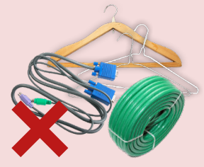
HANGERS, HOSES AND CABLES