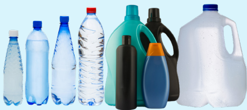
PLASTIC BOTTLES AND JUGS (LIDS ON)