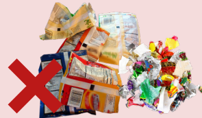
FOOD BAGS AND WRAPPERS